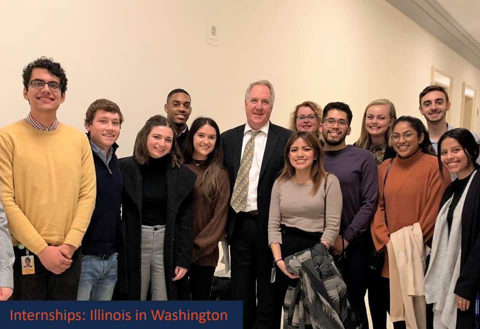
Internships: Illinois in Washington