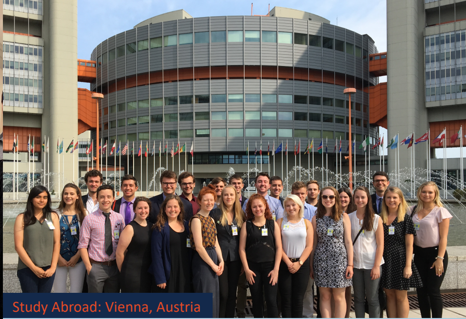
Study Abroad: Vienna, Austria