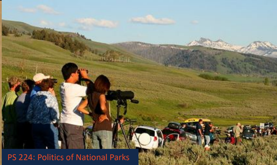
PS 224: Politics of National Parks