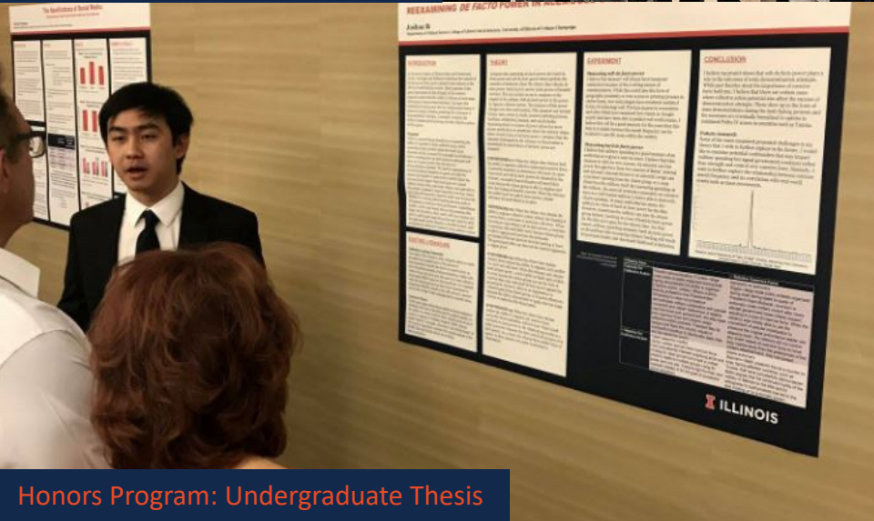
Honors Program: Undergraduate Thesis